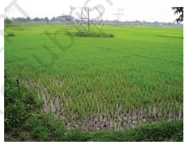
Fig. 4.4 (a): Rice Cultivation

Rice: It is the staple food crop of a majority of the people in India. Our country is the second largest producer of rice in the world after China. It is a kharif crop which requires high temperature, (above 25°C) and high humidity with annual rainfall above 100 cm. In the areas of less rainfall, it grows with the help of irrigation.