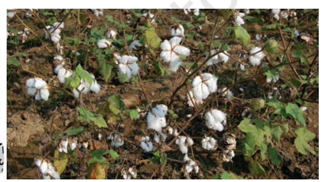
Fig. 4.14: Cotton Cultivation

Cotton: India is believed to be the original home of the cotton plant. Cotton is one of the main raw materials for cotton textile industry. India is second largest producer of cotton after China. Cotton grows well in drier parts of the black cotton soil of the Deccan plateau. It requires high temperature, light rainfall or irrigation, 210 frost-free days and bright sun-shine for its growth. It is a kharif crop and requires 6 to 8 months to mature. Major cotton-producing states are-