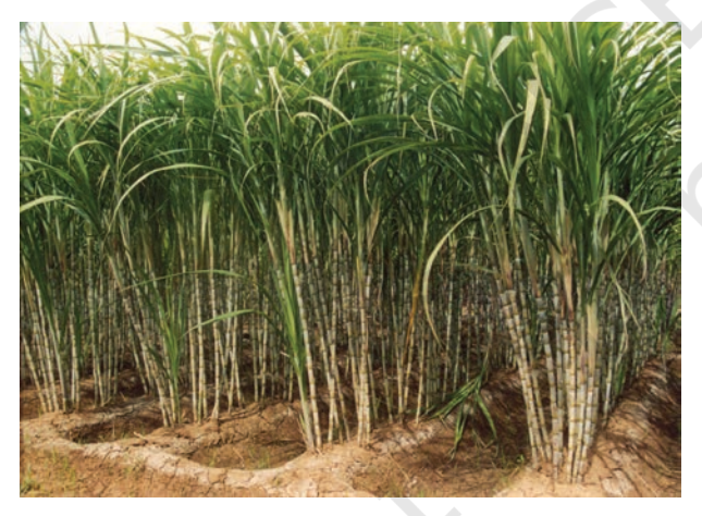
Fig. 4.8: Sugarcane Cultivation

Sugarcane: It is a tropical as well as a subtropical crop. It grows well in hot and humid climate with a temperature of 21°C to 27°C and an annual rainfall between 75cm. and 100cm. Irrigation is required in the regions of low rainfall. It can be grown on a