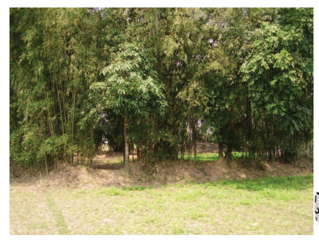
Fig. 4.3: Bamboo plantation in North-east