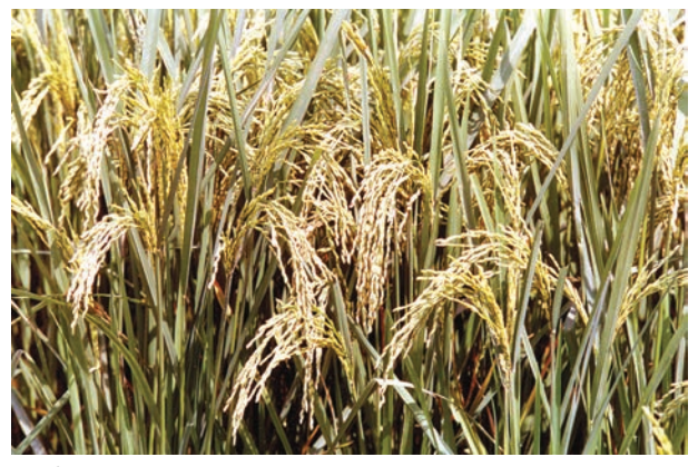
Fig. 4.4 (b): Rice is ready to be harvested in the field