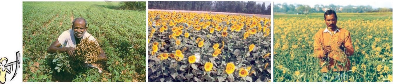
Fig. 4.9: Groundnut, sunflower and mustard are ready to be harvested in the field

Tea: Tea cultivation is an example of plantation agriculture. It is also an important beverage crop introduced in India initially by the British. Today, most of the tea plantations are owned by Indians. The tea plant grows well in tropical and sub-tropical climates endowed with deep and fertile well-drained soil, rich in humus and organic matter. Tea bushes require warm and moist frost-free