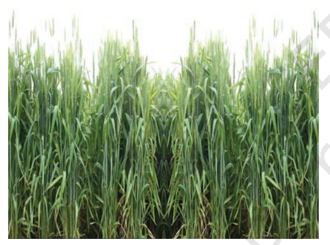
Fig. 4.5: Wheat Cultivation

Wheat: This is the second most important cereal crop. It is the main food crop, in north and north-western part of the country. This rabi crop requires a cool growing season and a bright sunshine at the time of ripening. It requires 50 to 75 cm of annual rainfall evenly-distributed over the growing season. There are two important wheat-growing zones in the country – the Ganga-Satluj plains in the north-west and black soil region of the Deccan. The major wheat-producing states are Punjab, Haryana, Uttar Pradesh, Madhya Pradesh, Bihar and Rajasthan.