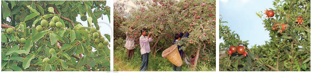
Fig. 4.12: Apricots, apple and pomegranate

Horticulture Crops: In 2020, India was the second largest producer of fruits and vegetables in the world after China. India is a producer of tropical as well as temperate fruits. Mangoes of Maharashtra, Andhra Pradesh, Telangana, Uttar Pradesh and West Bengal, oranges of Nagpur and Cherrapunjee (Meghalaya), bananas of Kerala, Mizoram, Maharashtra and Tamil Nadu, lichi and guava of Uttar Pradesh and Bihar, pineapples of Meghalaya, grapes of Andhra Pradesh, Telangana and Maharashtra, apples, pears, apricots and walnuts of Jammu and Kashmir and Himachal Pradesh are in great demand the world over.