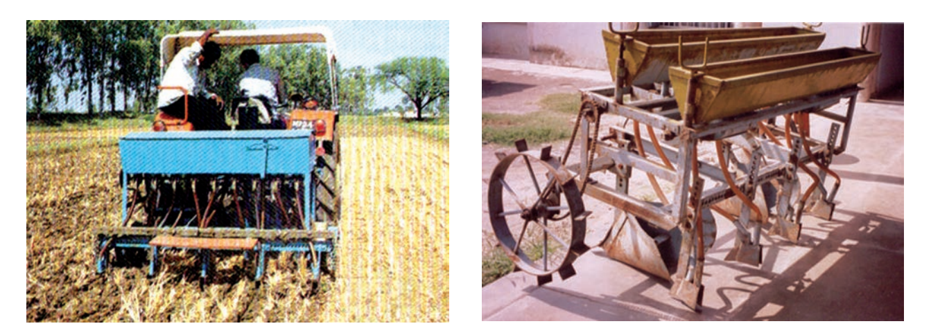
Fig. 4.15: Modern technological equipments used in agriculture

reforms. Provision for crop insurance against drought, flood, cyclone, fire and disease, establishment of Grameen banks, cooperative societies and banks for providing loan facilities to the farmers at lower rates of interest were some important steps in this direction.