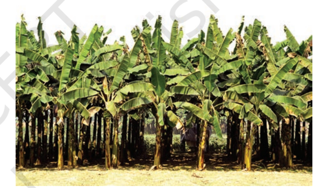
Fig. 4.2: Banana plantation in Southern part of India

In India, tea, coffee, rubber, sugarcane, banana, etc., are important plantation crops. Tea in Assam and North Bengal coffee in Karnataka are some of the important plantation crops grown in these states. Since the production is mainly for market, a welldeveloped network of transport and communication connecting the plantation areas, processing industries and markets plays an important role in the development of plantations.